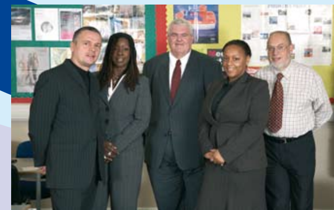
Meet the Post Sixteen team