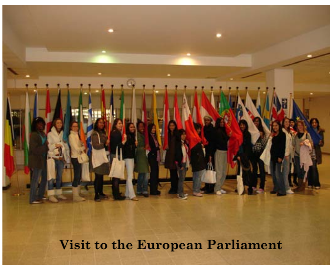
Visit to the European Parliament

..at GCE A level ..... in 2006 results were outstanding, with over three-fifths of candi- dates attaining grades A or B.