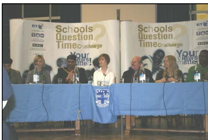
Schools Question Time

Students feel secure and well supported. One said, 'There are always people you can talk to if you have a potential problem.'