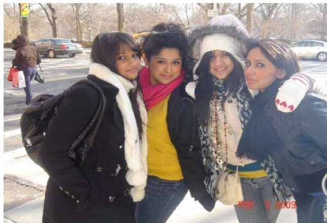
New York February 2009