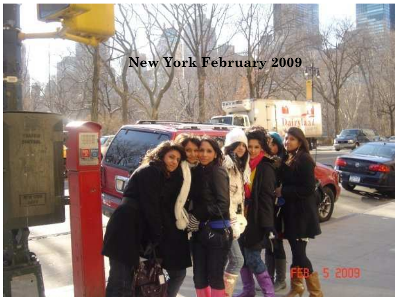
New York February 2009

Students welcome the opportunity to participate in enterprise projects and enjoy a range of enrichment activities in sports and the arts.