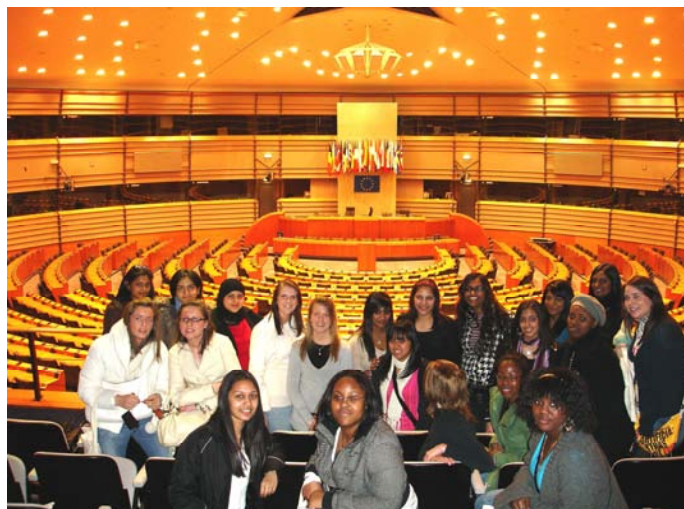
Visit to the European Parliament

Sixth Form life at the Ursuline focuses on high academic achievement. However, we also ensure that our students are fully prepared for all aspects of university life, the world of work and the challenges of a changing world in the twenty first century. Our curriculum includes a full and varied personal, social and health education programme, community service, religious education, information technology